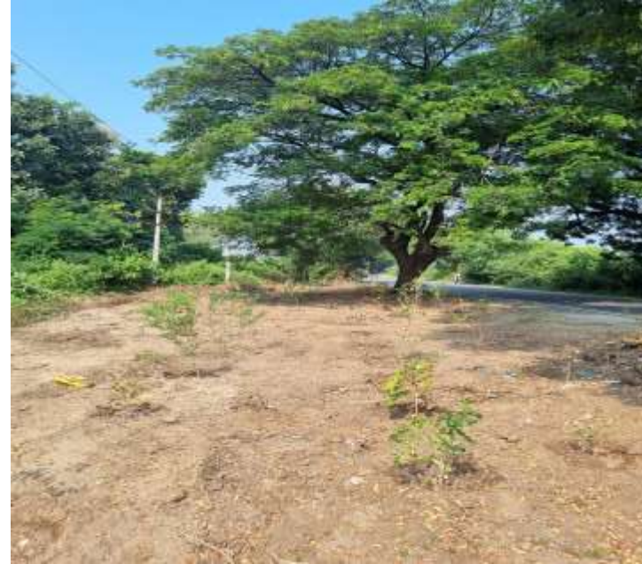
(Multilevel Avenue Plantation)