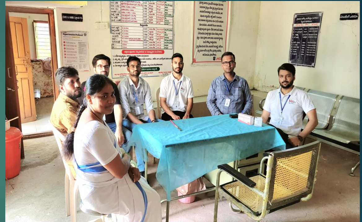
Health Sub Centre