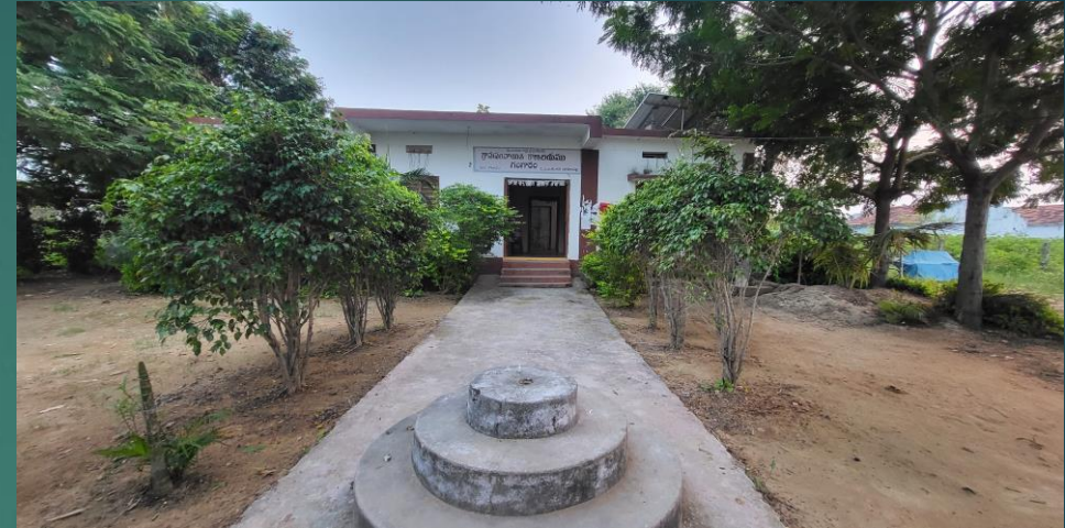
Panchayat Bhawan ( it has rooftop solar panel)