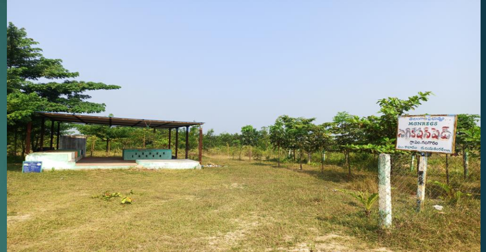
Waste segregation plant