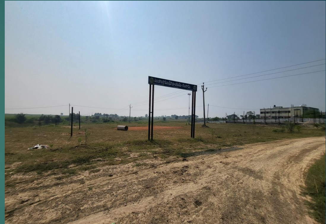
Palle Pragathi Vanaalu ( under construction)