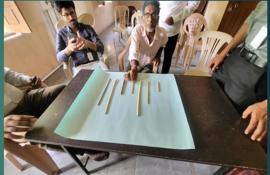
Villager involved in the activity regarding employment demand