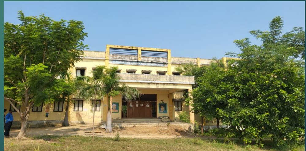
Telangana State Model School