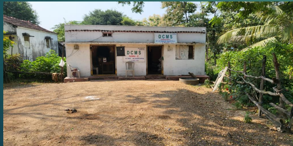
Fertiliser shop run by cooperative