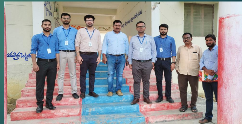
Social welfare centre