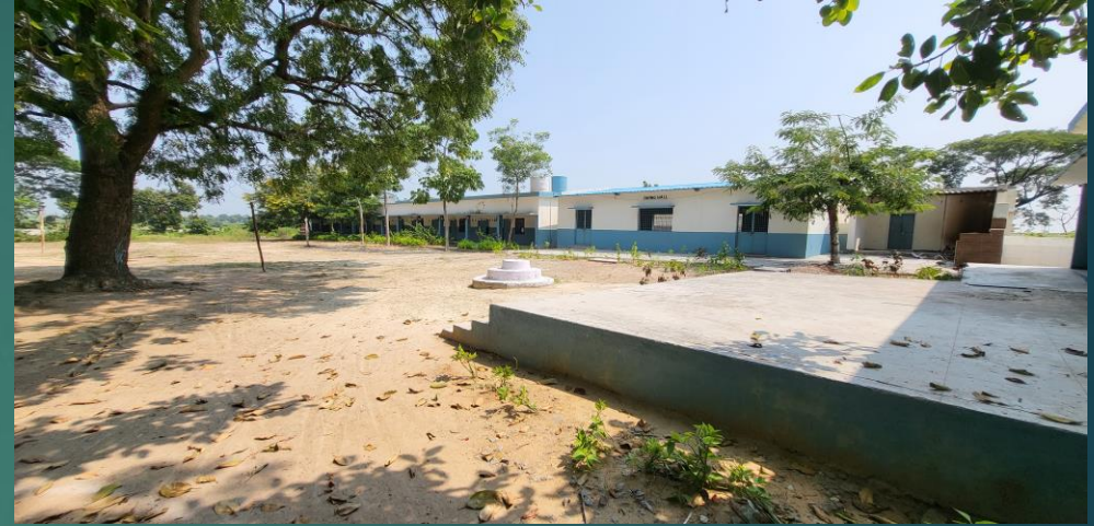
Zila Parishad High School