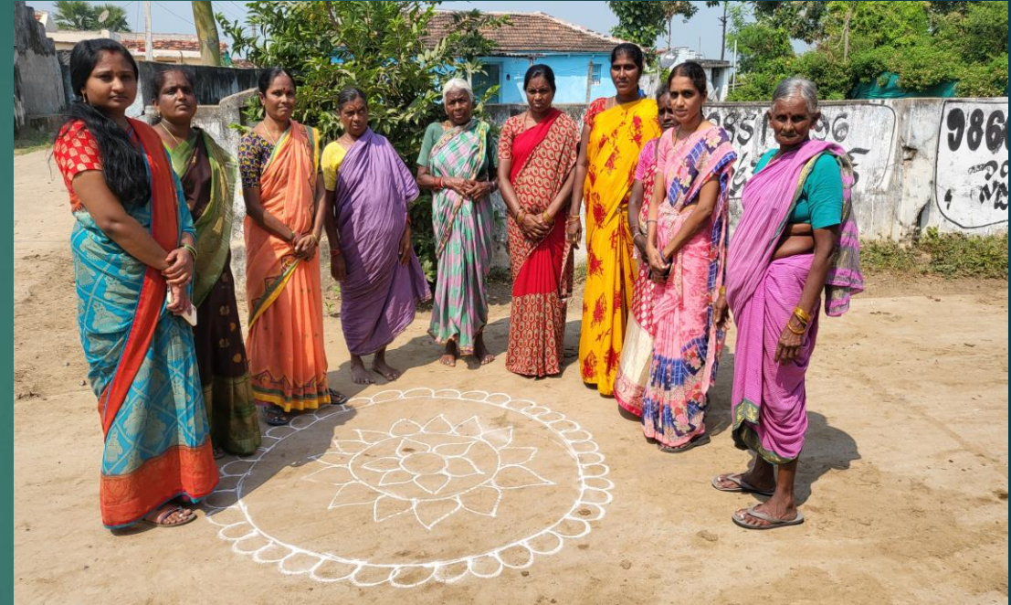
Women Self Help Group (SHG)