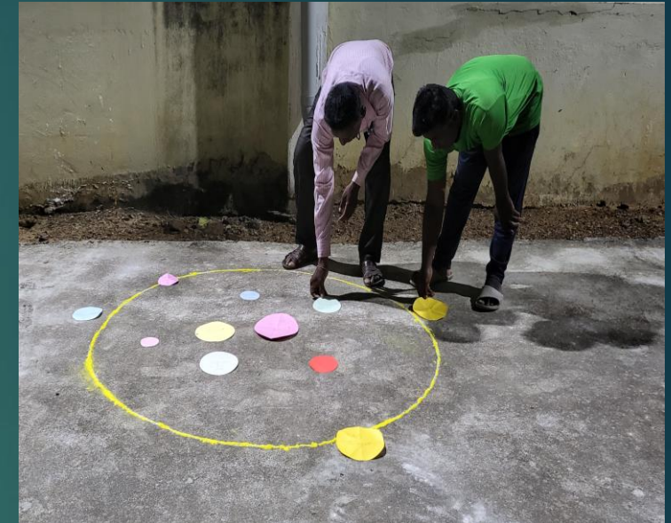
Villagers involved in the activity regarding various village institutes

The size of the circle indicates the importance of the institute for the villagers. The closeness to the centre of the big yellow circle indicates their satisfaction with the services of the institute.