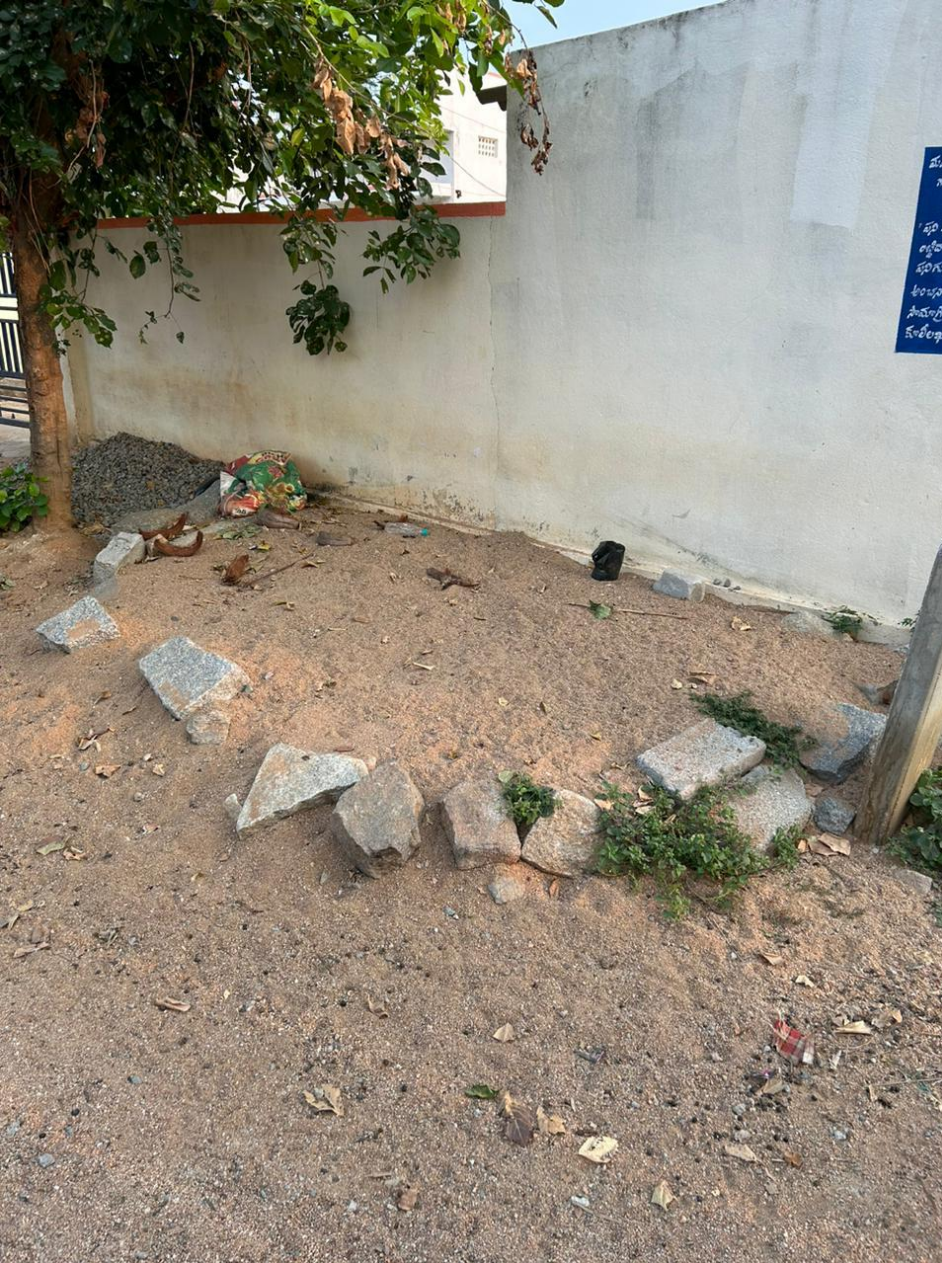
Individual Soak Pit