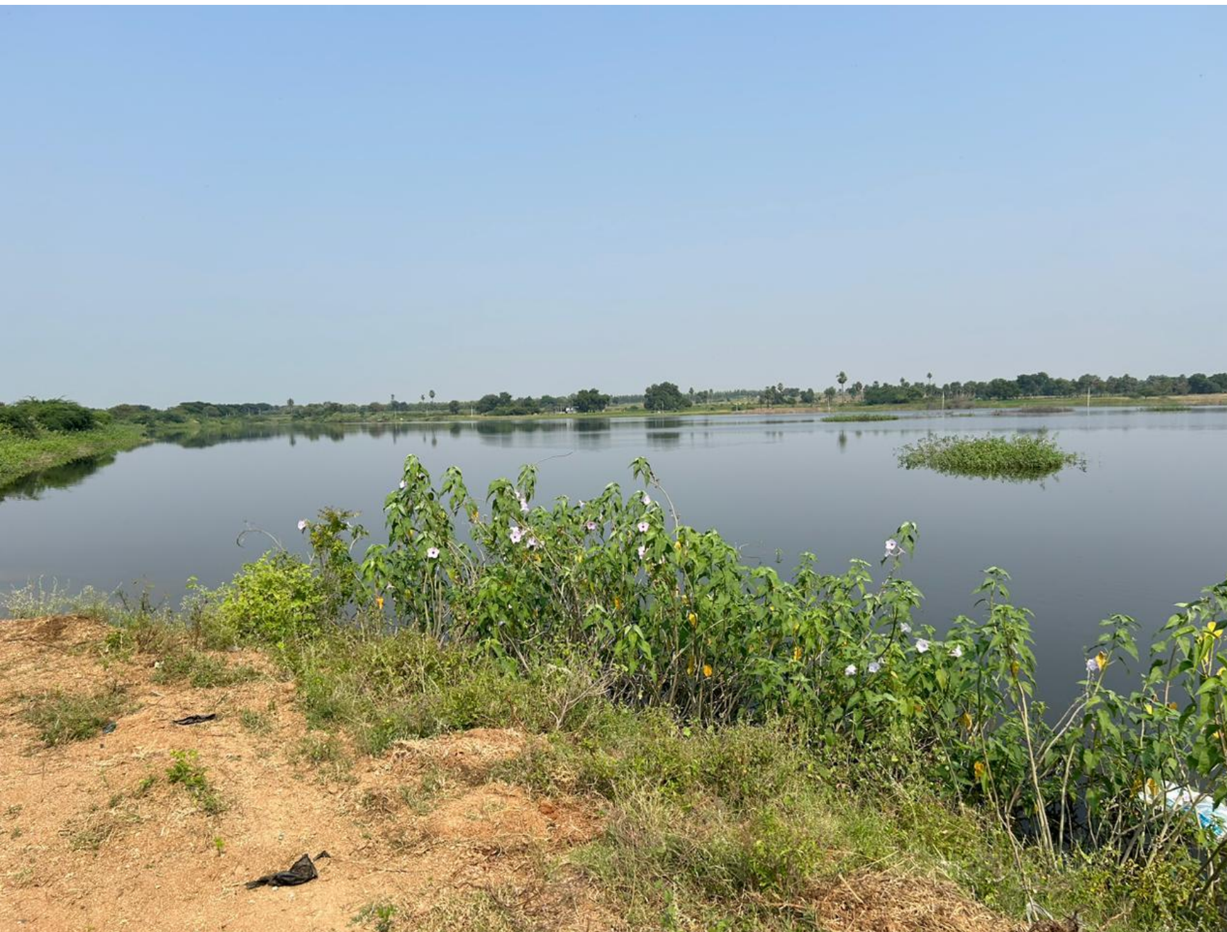
Ramanna Cheraboo Pond, VEPUR