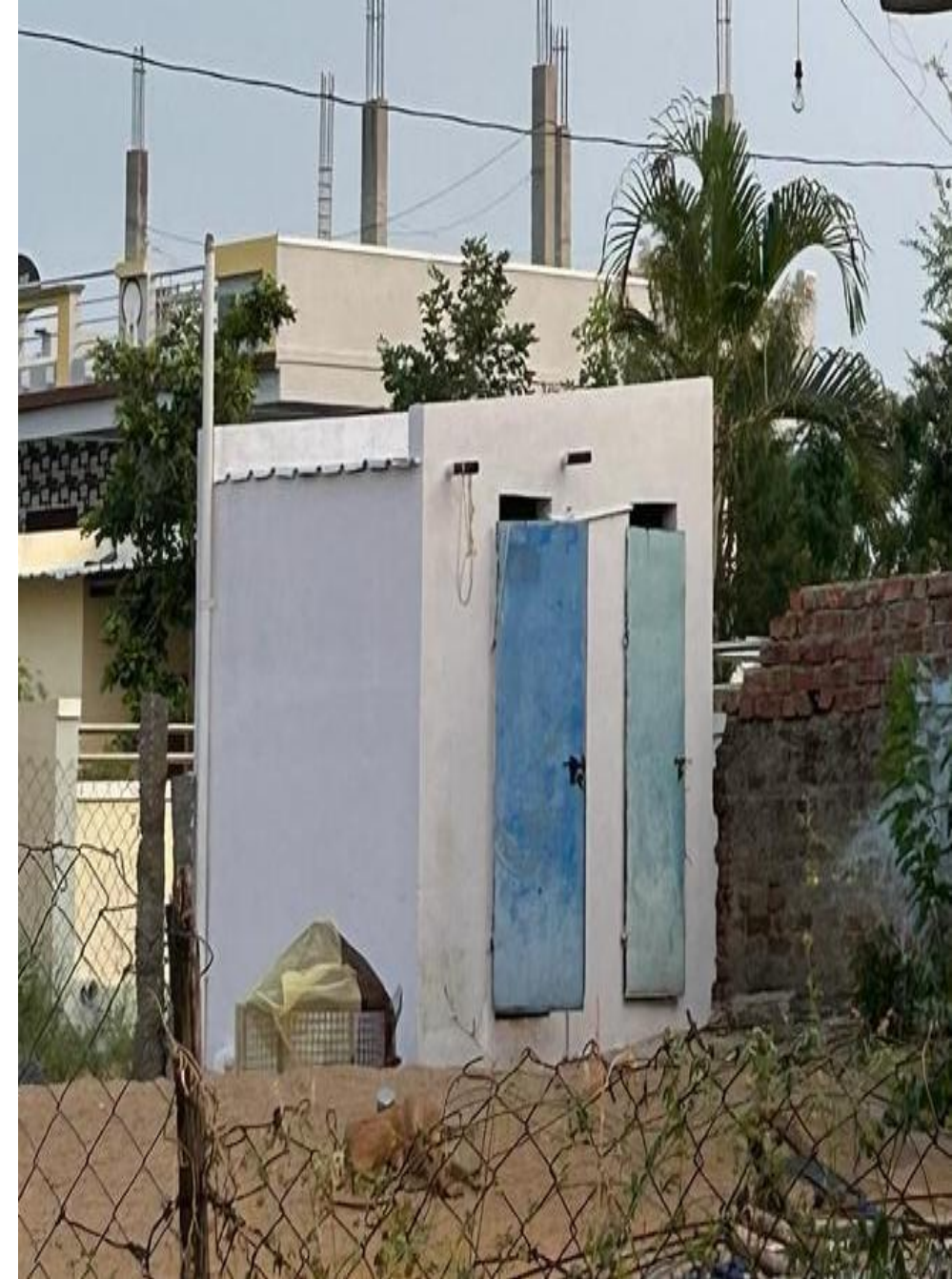
Toilet + Bathroom

Impact: Decreasing the faecal contamination in the Environment.