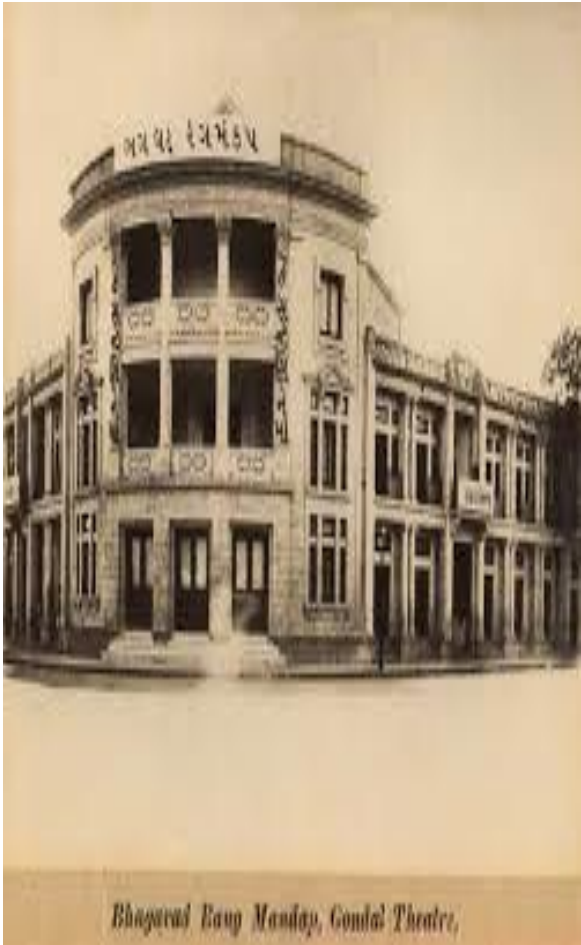
Bhagavad Gita Mandap, Gondal Theatre,