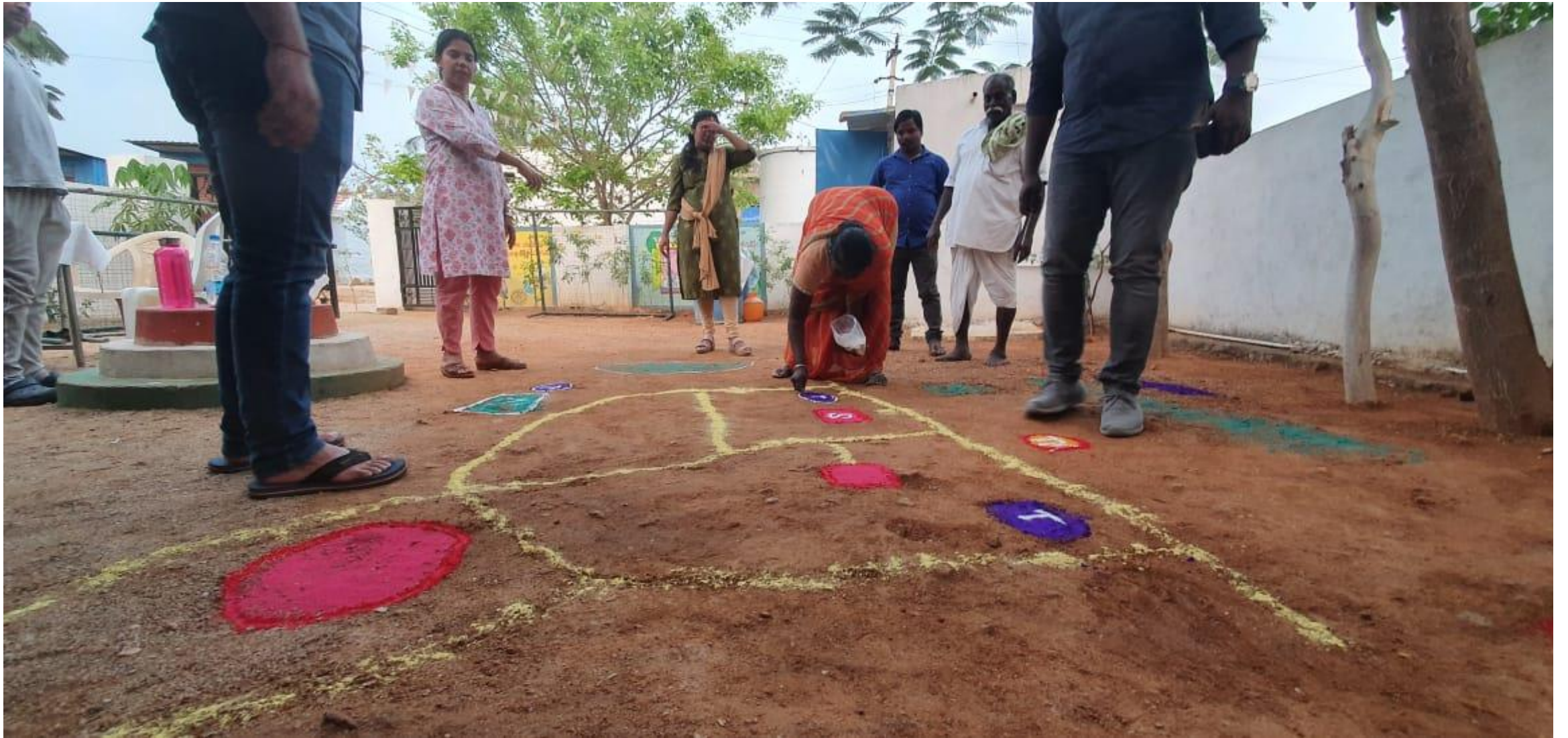
Village Resource and Social Map Making